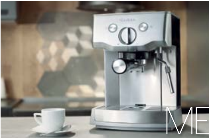
15 Bar Pump Espresso Machine