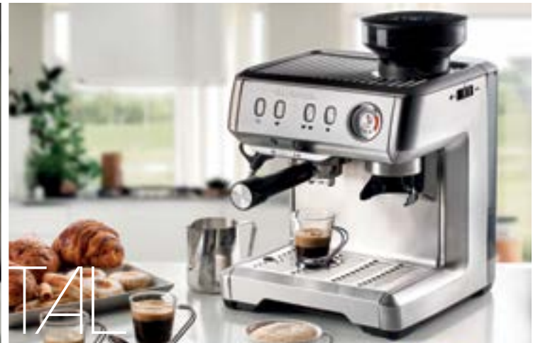
15 Bar Pump Espresso Machine with Grinder

Removable 1.5 litre water tank Cup heating base Removable drip tray