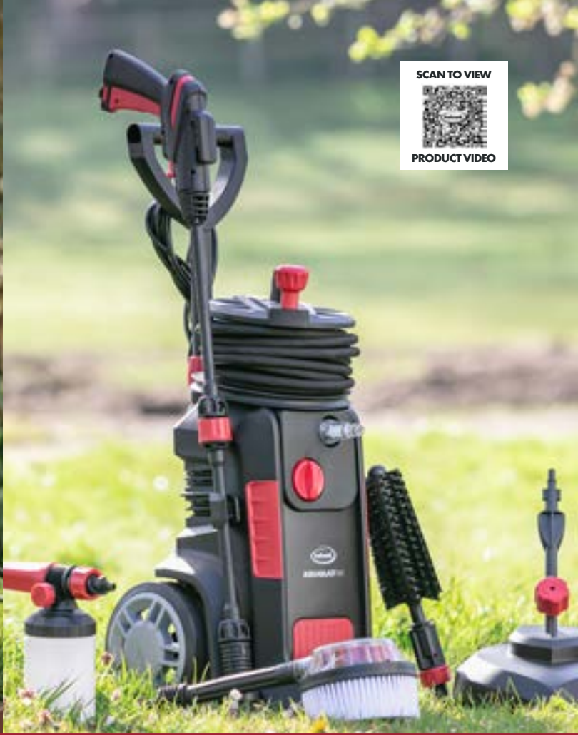
AQUAROVER 140 OUR MOST VERSATILE PRESSURE WASHER